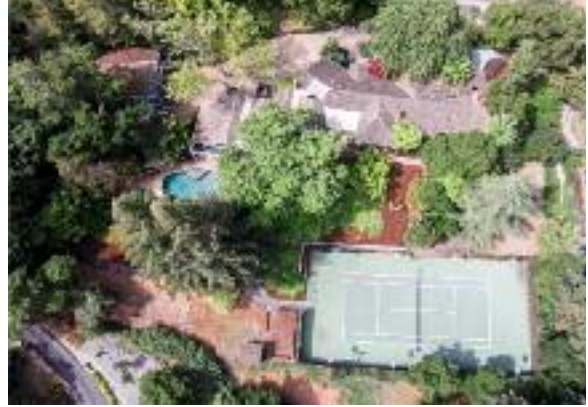
3911 Happy Valley Road Lafayette

Estate style living with privacy, vintage charm and thoughtful updating. Gorgeous 1.53 acre lot boasts 5750 square feet with a 5 bed/7 bath main residence (including in law) & a detached 1 bed/1bath guest house. Pool, lighted tennis court & views of the hills.